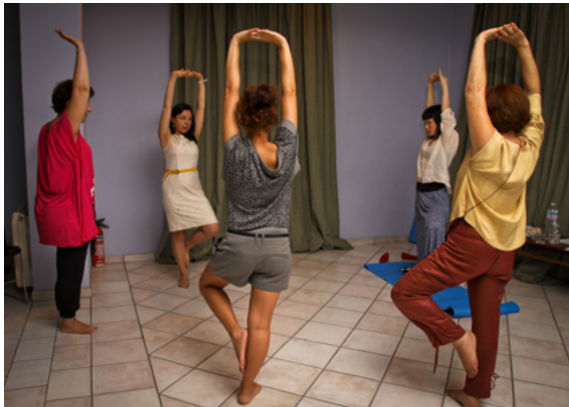
Doing the Tree Pose as part of a session on performance nerves

Piano-Yoga® utilises aspects of movement, gravity and breathing to create a more natural and organic approach to piano playing, which also makes for an